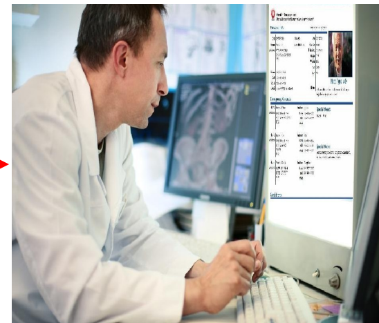
Emergency Room Computers